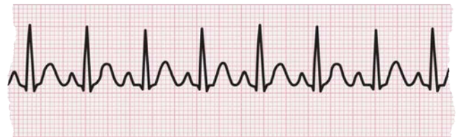
ECG strip showing tachycardia