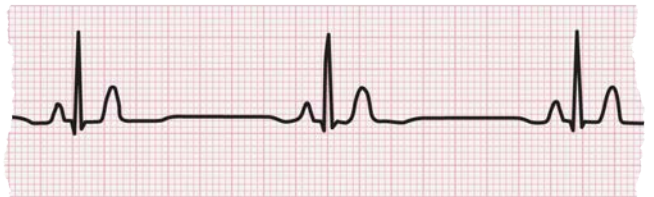
ECG strip showing bradycardia