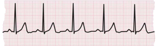
ECG strip showing a normal heartbeat