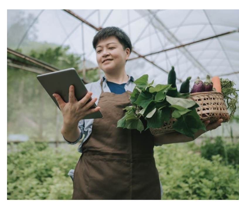
American Heart Association Issue Brief: Affordable Nutrition | 9