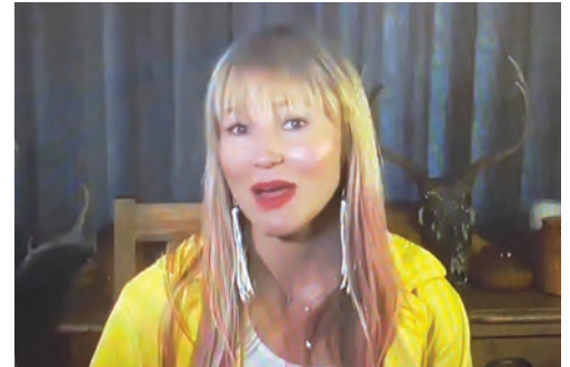
Jewel, Grammy-nominated singer-songwriter and mental health advocate

The annual American Heart Association Foodscape Innovation Summit serves as an opportunity to convene multi-sector food system voices and delve into innovative, forward-thinking, and evidence-based opportunities for collective action to transform the food system toward nutrition security for all. The Fifth Annual Foodscape Innovation Summit , held on June 18, 2020, focused on nutrition security, related disparities and inequities, and the impact of the COVID-19 pandemic, as well as innovation aimed towards a healthier food ecosystem. Award-winning singer/songwriter, Jewel, shared her personal journey from homelessness to well-being through song and meditation. Participants returned on July 9, 2020 to participate in breakout groups that explored the potential to harness knowledge gained from the current public health crisis to strengthen the health focus of the food ecosystem equitably.