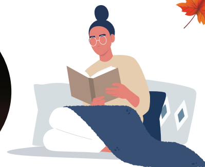
A good book