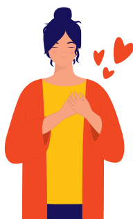
A grateful mood