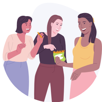
A shared snack