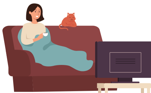
A favorite show