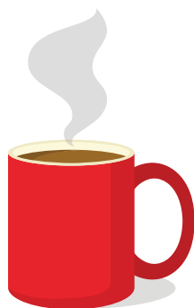
Your morning coffee

Here are a few things to enjoy and be thankful for: